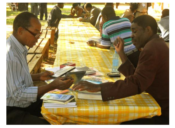
Pastors checking out their book purchases

The conferences are four-day meetings comprised of 16 teaching sessions. The theme for this year was "Developing a Christian Worldview," and we had two of our favorite speakers bringing 11 of the messages.