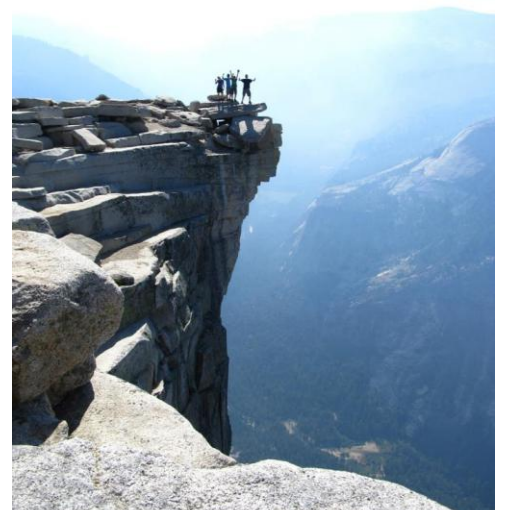
The kids on the "diving board" of Half Dome, a favorite hiking destination in Yosemite