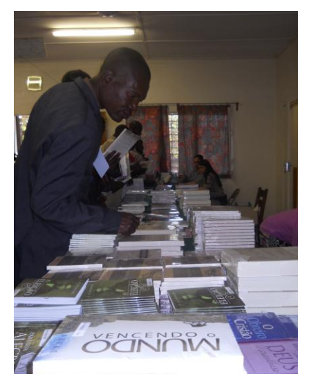
Pastor purchasing books in the conference bookstore

Last year the conference suffered a decline in participation for the first time ever, and it was a precipitous drop from 315 to 230 persons. However, this year we rebounded to equal the attendance of two years ago with 315 pastors, church leaders, and wives present. With an additional 55 people serving as staff, volunteers, and hired workers, the kitchen had to feed 370 people each meal, an all time record. If everyone who paid in advance had been able to come, we would have far exceeded our highest attendance ever with 390 church leaders present from all of Mozambigue's ten provinces. We are thankful for the increasing influence these conferences are having on the church in Mozambique.