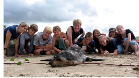
The kids find an exhausted sea lion on one of their beach walks

Surrounded as we were, it would have been hard to please one elephant without riling another! Thankfully, none of them took offense at our presence.