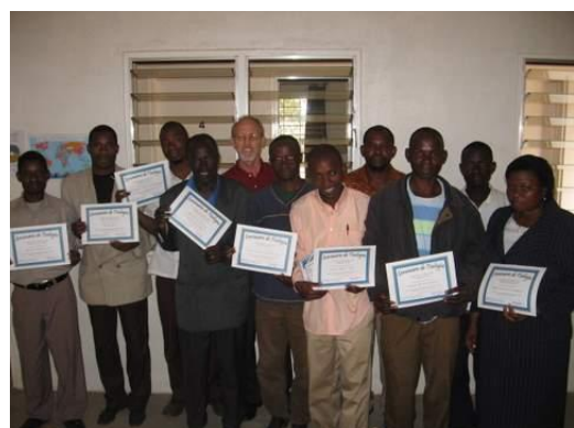
Graduates of the FIEL Seminar