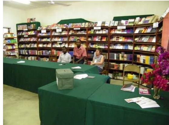
The bookshop beautified