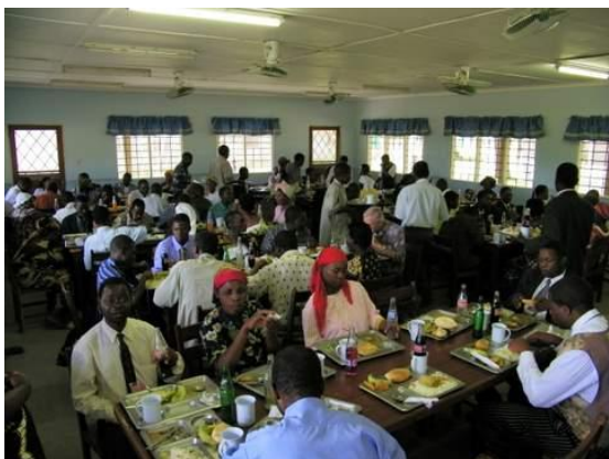
One of three dining areas at the conference

developed over the past 18 years. While I much appreciated the fine teaching on the Christian home and the points that were raised by our speakers, I am convinced that the single most important element in transforming our families, churches, and communities is regular worship in the home consisting of daily instruction from the word of God, time spent praising Him through excellent hymns and choruses, and prayer on our knees as family members beseech God in behalf of their communities and one another. The family that repeatedly reads through the whole Bible together ends up covering every conceivable matter that needs to be addressed in preparing children for life in this world (II Tim. 3:16-17). Potential problems get worked out at the family altar even before they can manifest themselves - or perhaps family worship simply brings