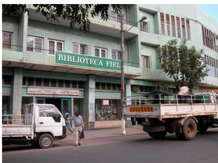
Front view of the Fiel Bookstore